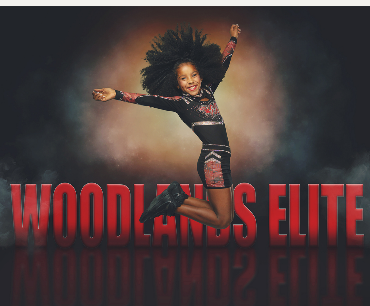
smoke and mirrors

Choose your favorite backdrops. Use your own pose or use the pose shown in the photo. Individual images with one person per photo are $10 each. Images with two or more people per photo are $20 each.