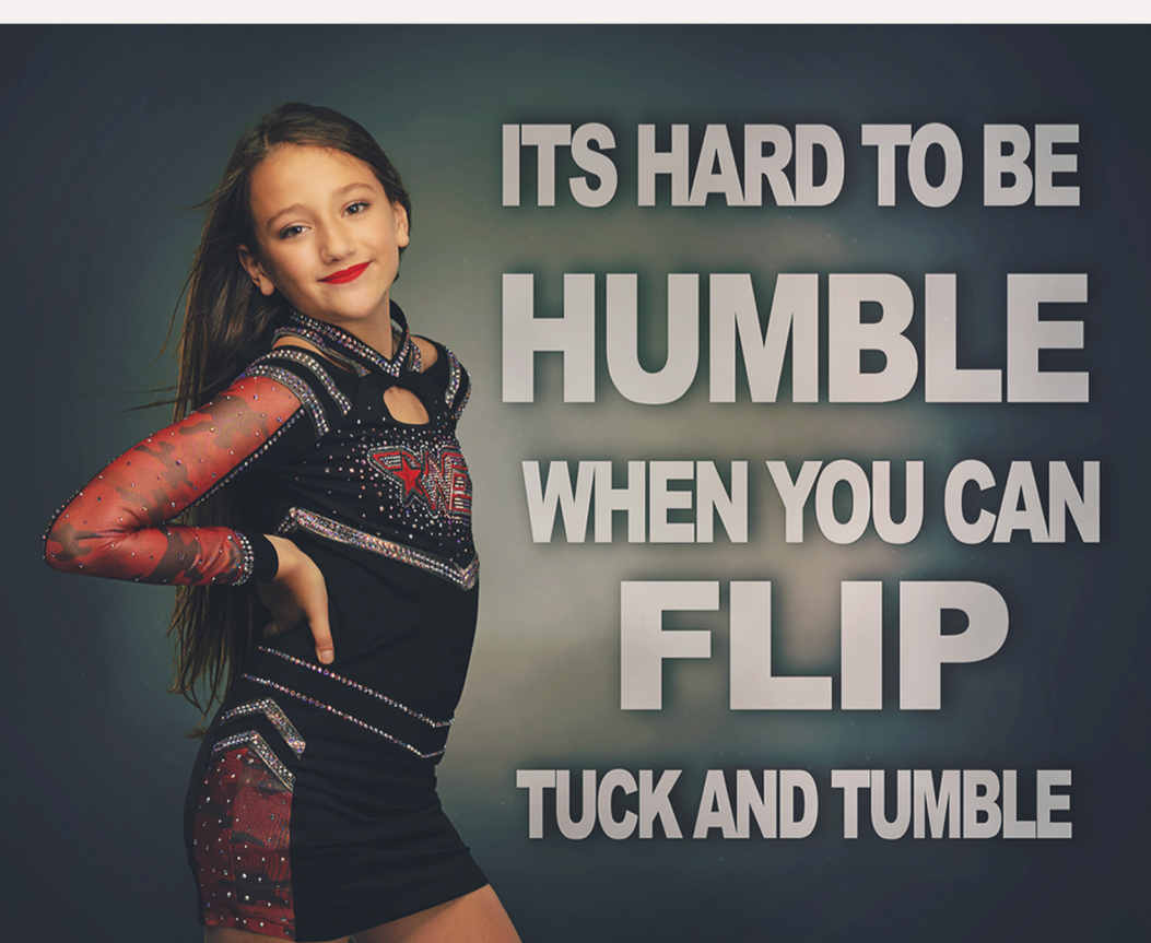
flip and tumble