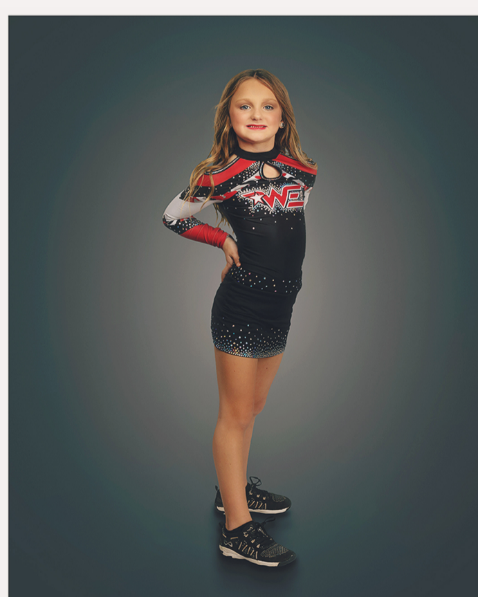
full body or close up with solid grey backdrop