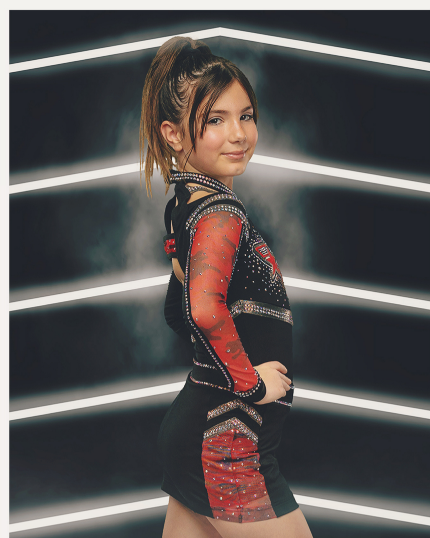
light em up